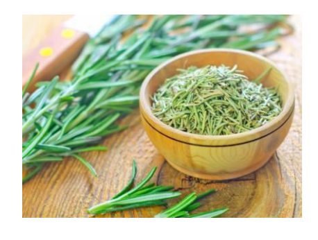
superior natural antioxidant and more health properties